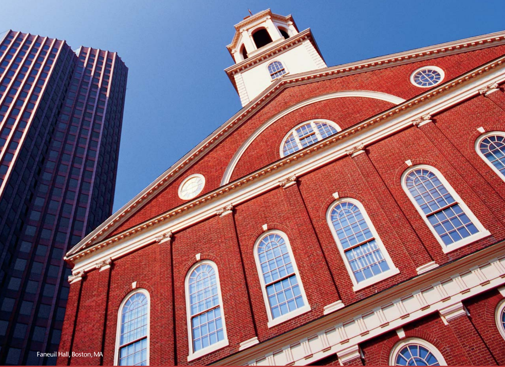
Faneuil Hall, Boston, MA